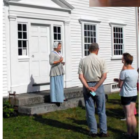
Young Docents is a six session program during May and June for young people age 12-18. Classes include meeting with Wilson Museum staff, touring behind the scenes, and collaborating with other students to refine

research and public speaking skills. The Young Docents program will culminate with presentations at the Wilson Museum's annual Members Reception in June.