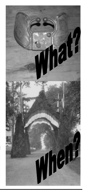
Wilson Museum Bulletin